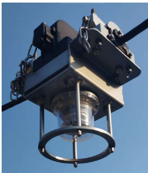
Light Signaling for Energized Cables